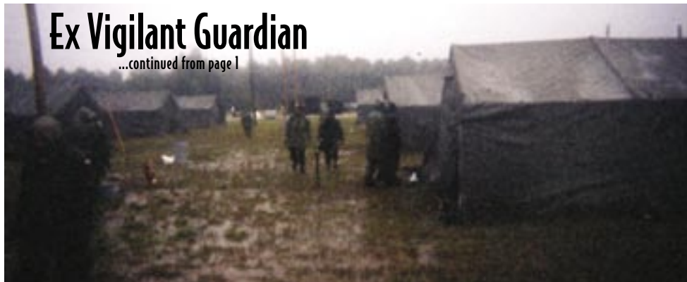
The weather during the 1st two days of Exercise Vigilant Guardian.