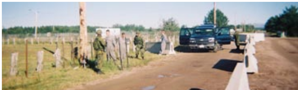
Members of the 48th searching locals and their vehicle before allowing entry to the camp.