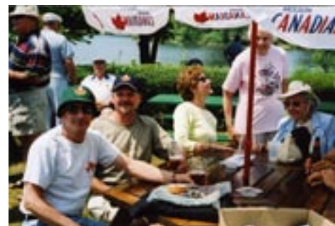
A bunch of guys were whooping it up.