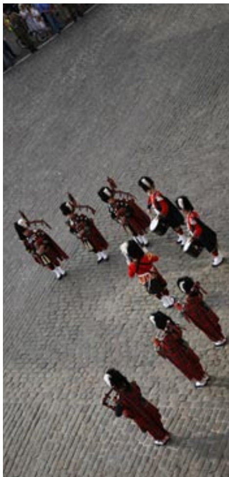
Above and below: Pipe Band performing in Warsaw.