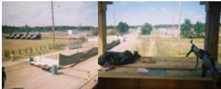
The front gate of forward operating base Steadfast.