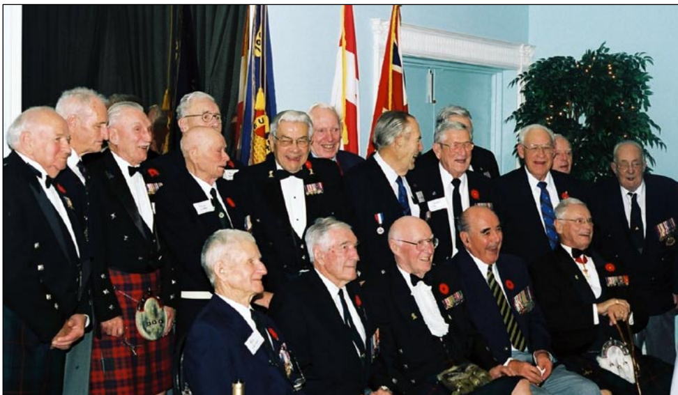
Our 48th Highlander veterans at the Remembrance day dinner on November 6, 2005