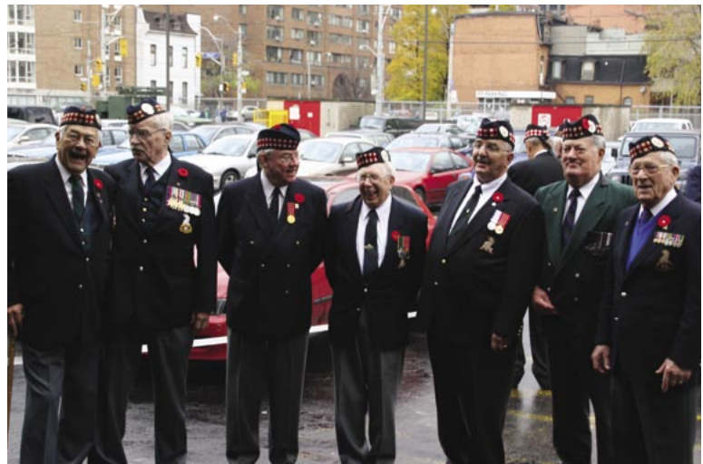
Some familiar faces waiting outside the armouries