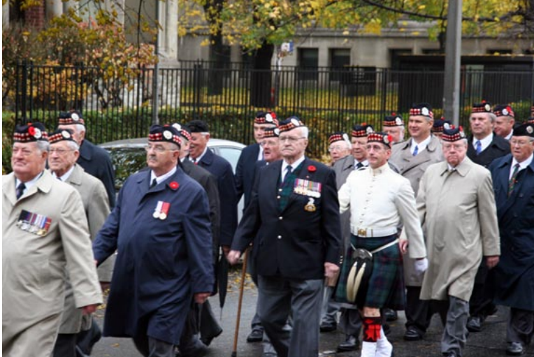
The Old Comrades on route to the Cenotaph