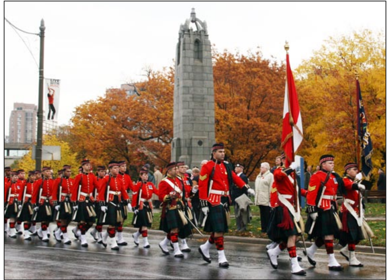
The Colours and active unit on route back to the armouries