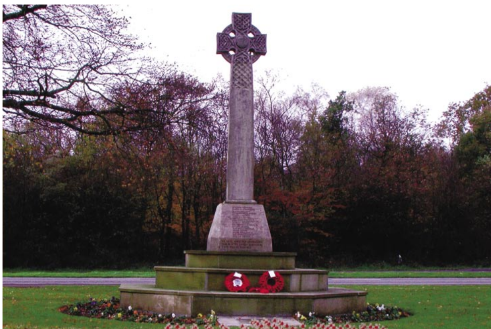
Kingswood Memorial War Memorial at Kingswood, Surrey following the Dedication Ceremony – Sunday 14 November, 2004