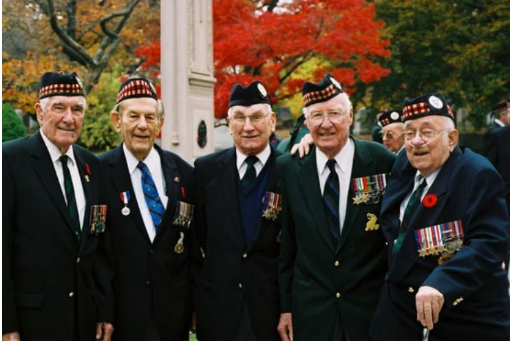
Mount Pleasant Cemetary - Saturday, 1100 hours, a pre-parade photo