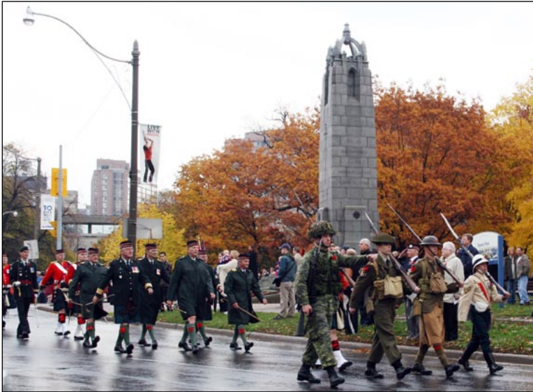
The Sentries and the Honoraries and former COs leaving the monument