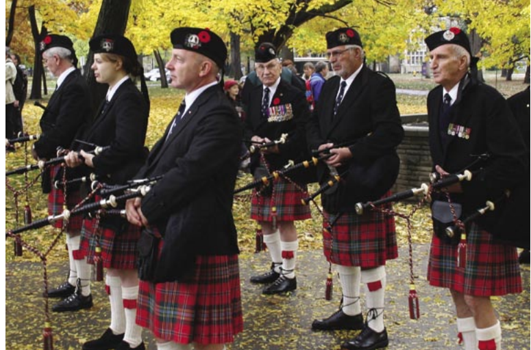
The Pipers at the Monument