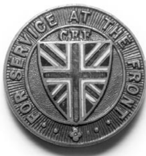
War Service Badge, Army Class "A"

"For conspicuous gallantry and devotion to duty. This officer commanded the left half of a skirmishing line against a railway, reaching it by his able leadership as the flanking units had not come up, and he only had his own support to rely on. On arrival at the objective, the officer in charge of the right half company was wounded, he took command of the whole line, which he occupied, although fired at by field guns over open sights at 80 yards."