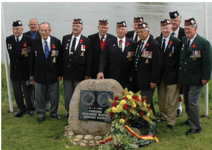
Our 48th Highlanders at the marker of the crossing of the Ijssel River