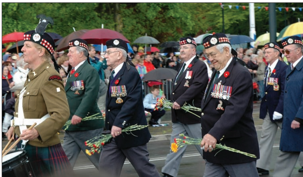
Our 48th Highlander veterans leading the parade in Apeldoorn