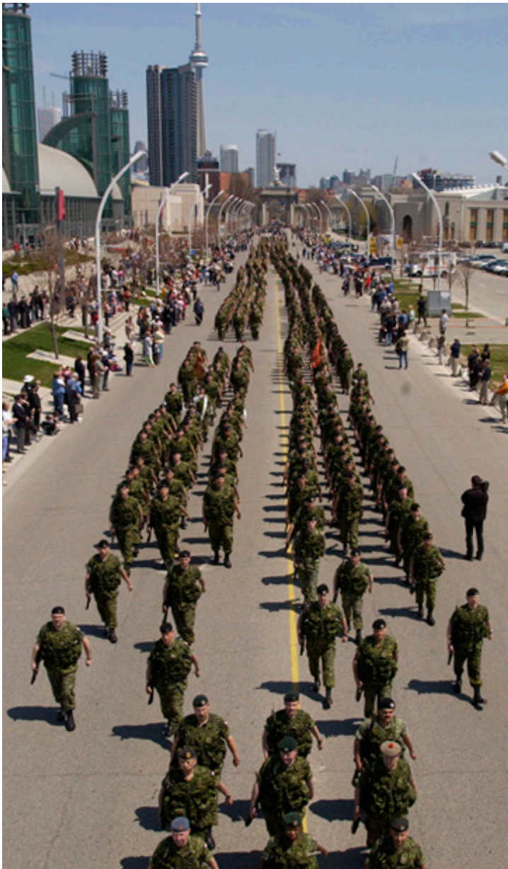
Soldiers of 32 CBG marching through the CNE grounds