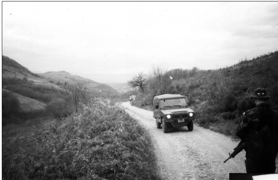
On route to the front.

CPL THOMSON and members of 2 Sect 2 Pl, A Sqn, RCD BG, Op Palladium Roto 13