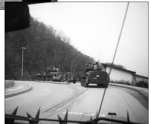
In convoy to Velika Kladusa.

All in all going on tour has been a positive experience for the soldiers of C/S 32, enabling us an opportunity to see how our Regular Army and other nation's armed forces work in