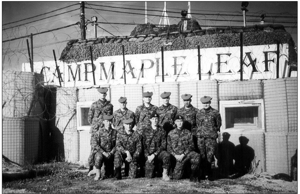
The Complete Section - 2 Sect 2 Pl A Sqn, RCD BG Op Palladium Roto 13

Operations. C/S 32 was involved in five different Ops inside and outside of our AOR. The Ops varied in task; but most were based on searching homes and cars for illegal weapons. C/S 32 worked together with many organizations to succeed in completing these tasks. The local