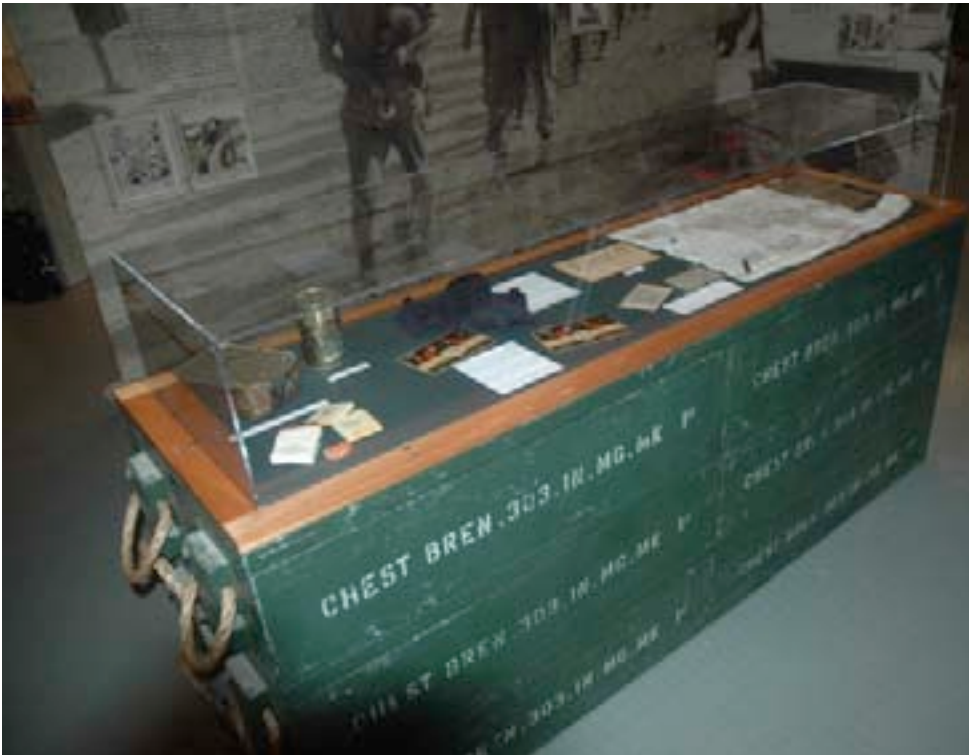
BOTTOM: display case for Terrain Panel. The case was designed to represent a stack of bren gun chests. It copies the original in the 48th museum.

years ago, each carefully numbered by her in pencil. In one of these letters he talked about their long time apart. Let me read you a small portion: