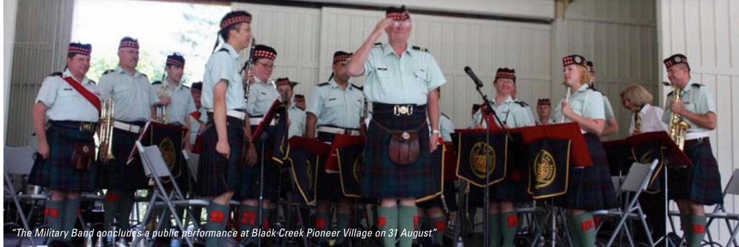
"The Military Band concludes a public performance at Black Creek Pioneer Village on 31 August"

During the period July 29 – August 2, 2009 the Gordon Highlanders, in concert with the City of Aberdeen and the Aberdeenshire Council, will hold an International Beating Retreat. Five members of the 48th Highlanders Pipes and Drums will join a Pipe Band of 100 for the four day celebrations. The International Beating Retreat is Aberdeen's contribution to Homecoming Scotland 2009 which celebrates the 250th anniversary of Robert Burns' birth with a year-long programme of events across Scotland.