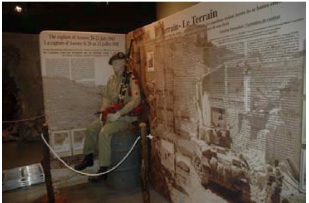
ABOVE: Terrain panel featuring battle tactics. Regalbuto is featured on the main panel. Assoro is on the side panel.